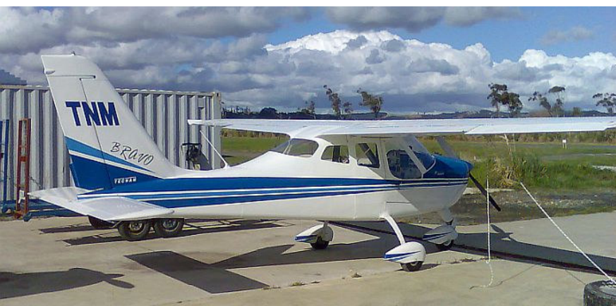
Pictured: ZK-TNM syndicate aircraft

resources to buy and maintain an aircraft. Many syndicates have around 5 members, however, large groups may have in excess of 25. Some of our own Parakai Flying School students are now proud aircraft owners in the ZK-TNM syndicate with their new aircraft based at Parakai. Contact Simon if you would like more information on forming or buying into a syndicate.